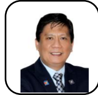
Rodell Riezl Reyes District Governor