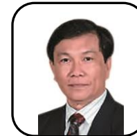
Ismael Tabije Club Service